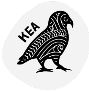
Year 1/0 5 years old