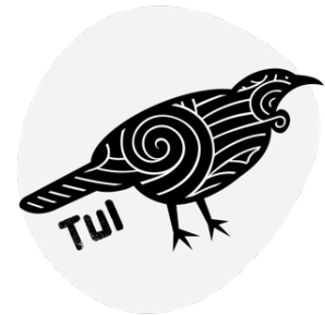
Year 2 6-7 years old