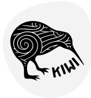
Year 1 5-6 years old