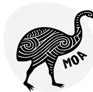
Year 5/6 9-11 years old

Our teams are named after five New Zealand birds and learners are placed into these teams according to their chronological age.